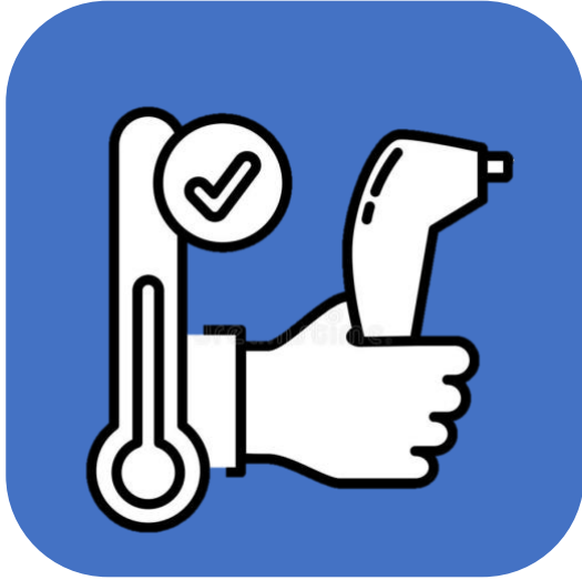
Monitoring of Health Conditions