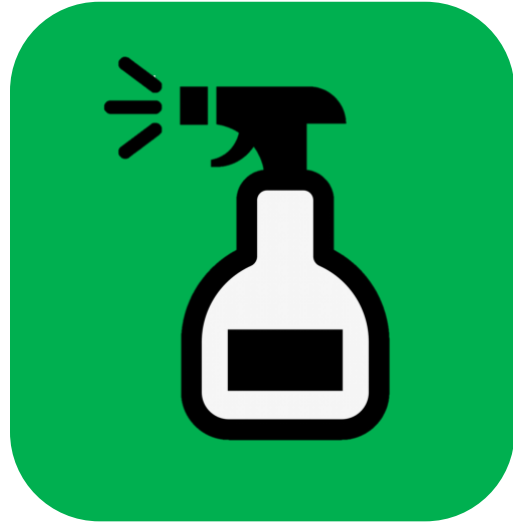
Cleaning, Disinfecting, Sanitizing