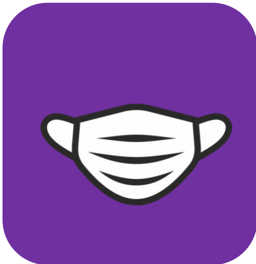
Personal Protective Equipment